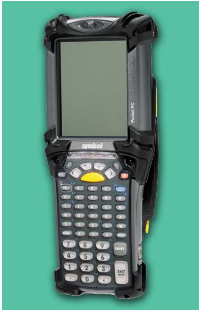
Lakeside School uses the Symbol MC9000-K with their FOOD-TRAK Mobile Partner software to significantly reduce inventory time.

FOOD-TRAK is a Registered Trademark and a Registered Service Mark of System Concepts, Inc.